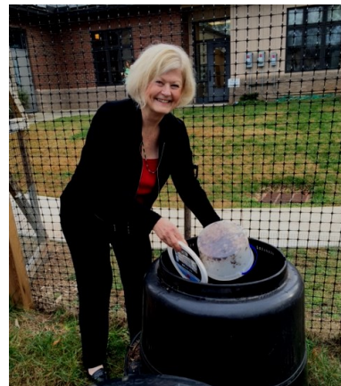
Nativity member adding kitchen scraps from home to a compost bin at church

Meat, fish, bones, dairy products, oils and fats, sauces, ashes, pet waste, diseased plants, weeds (especially with seeds), grass clippings.