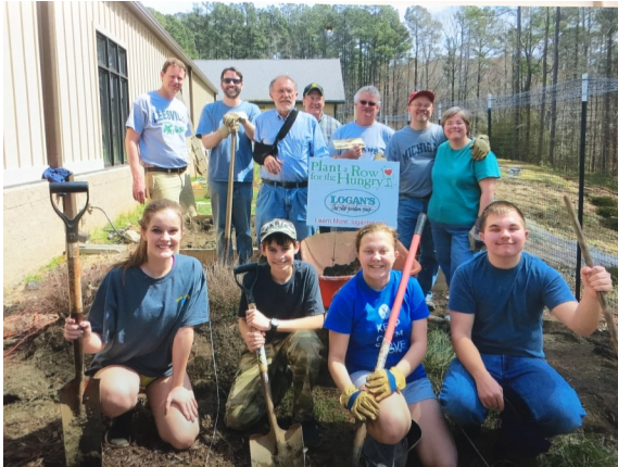
Nativity Community Garden was expanded in 2014

Many ways are being developed to sequester carbon. We all can help to slow climate change by making compost, which when applied to the land will increase plant growth leading to more carbon being removed from the air and stored in the soil in a process referred to as “carbon farming”.